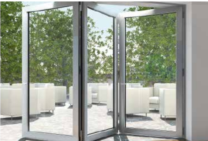
Folding sliding systems