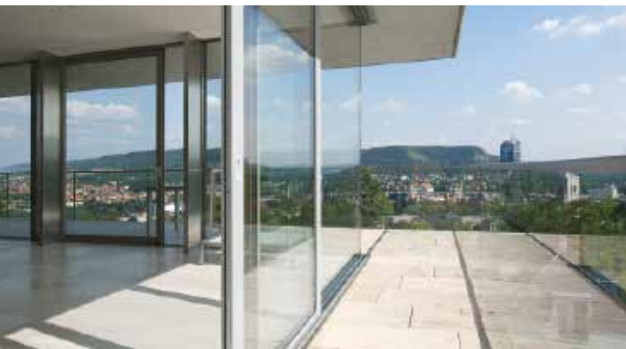
Architecture flooded with light