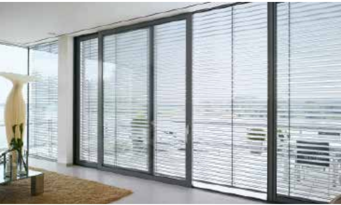
Transparent interior design